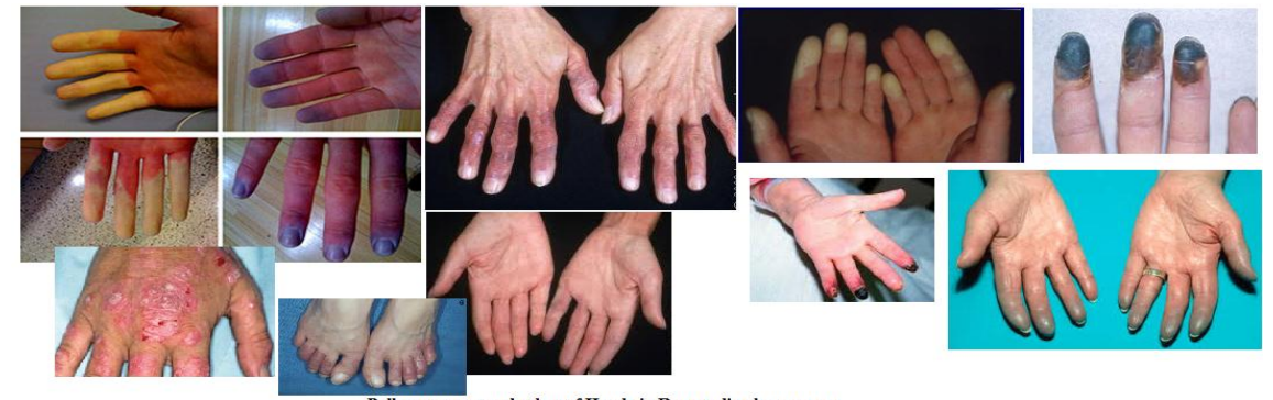
Pallor, cynosys and rubor of Hands in Raynaud's phenomenon Fig.5: Pallor, cyanosis and rubor of hands in Reynaud's phenomenon<sup>[6]</sup>

red (rubor), and then back to normal, often accompanied by swelling, tingling, and a painful "pins and needles" sensation.