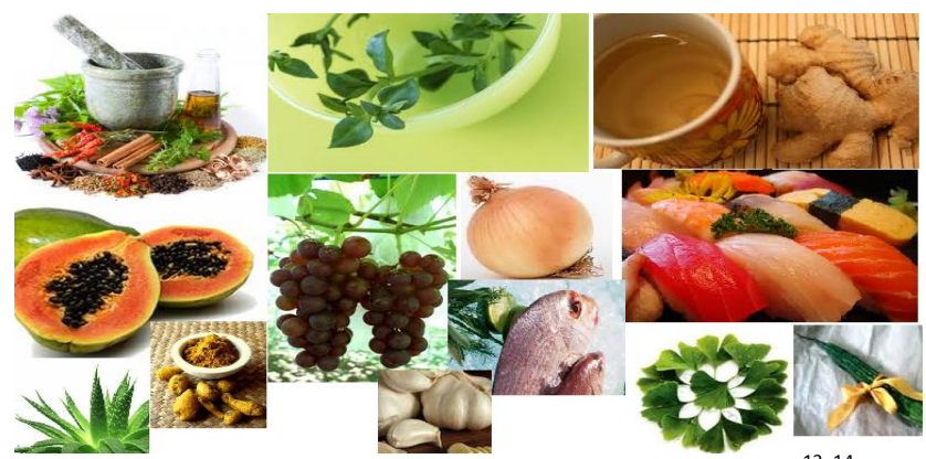
Fig.8: Herbal products used in Raynaud's phenomenon<sup>13, 14</sup>

- Use proper job design with scheduled breaks to reduce exposure to vibration.