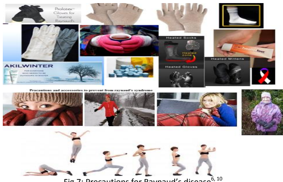
Fig.7: Precautions for Raynaud's disease<sup>6, 10</sup>

- Protect your hands and feet from injury.